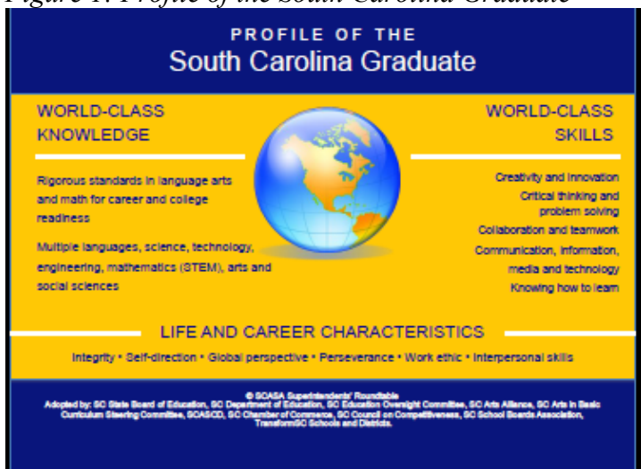
Figure 1: Profile of the South Carolina Graduate

Note: The Profile of the South Carolina Graduate represents the SCDE's vision for student learning in the state, and has been adopted by a wide body of stakeholders and the state's General Assembly. Source: South Carolina Department of Education. (2017). Retrieved from <a href="http://ed.sc.gov/newsroom/profile-of-the-south-carolina-graduate/">http://ed.sc.gov/newsroom/profile-of-the-south-carolina-graduate/</a>.