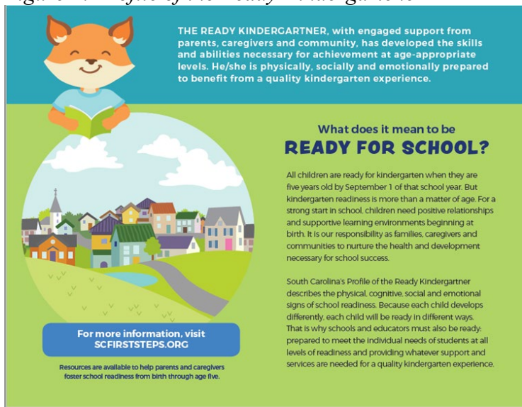
Figure 2: Profile of the Ready Kindergartener